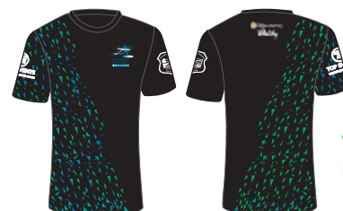
T-SHIRT R 215